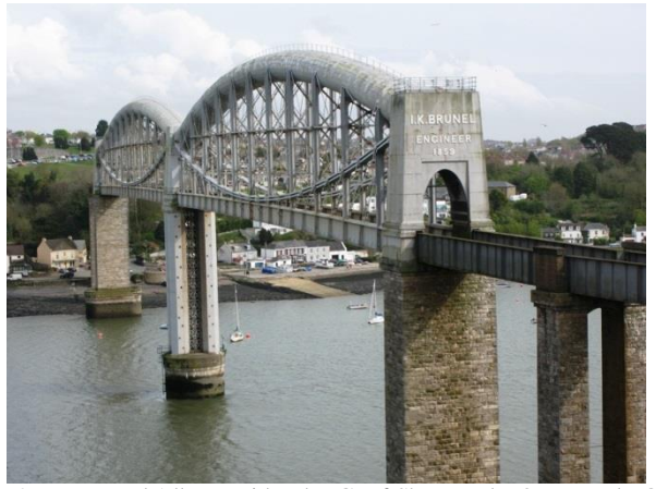
Photo: Roy al Albert Bridge by Geof Sheppard - Own work, CC BY-SA 3.0,

https://commons.wikimedia.org/w/index.php?curid=6554012