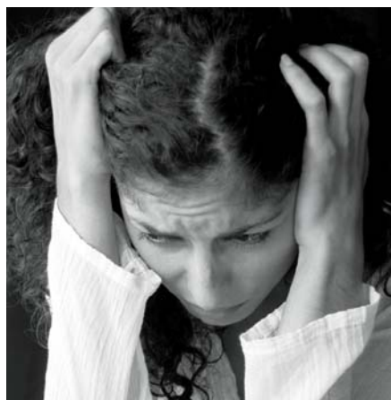
The stress of insecure employment can have serious detrimental effects to employees' health

The Fixed Term Employees (Prevention of Less Favourable Treatment) Regulations 2002 exist to ensure that staff on fixed-term contracts have the same rights as those on permanent contracts, and employment law obliges employers to offer redeployment or retraining before making staff redundant. No job should be advertised externally if the vacancy could be filled by an internal member of staff threatened with redundancy.