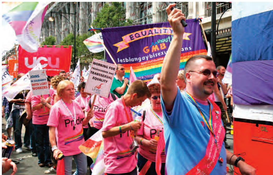
Above: LGBT UCU members marching with other unions at Pride