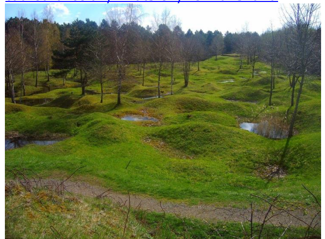
Verdun battlefield (2005) public domain

It showcases the photographic work of women who, working as nurses, ambulance drivers and official photographers, experienced the conflict first-hand, as well as work by modern day artists and soldiers directly inspired by WW1. https://bristol-cathedral.co.uk/whats-on/no-mans-land